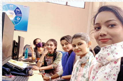
CRM Associate (Girl candidates only)

Min. Qualification: 10th Duration: 3 months