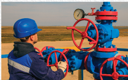
Pipe Fitter City Gas Distribution

Min. Qualification: 10th/12th/ITI Duration: 6 months