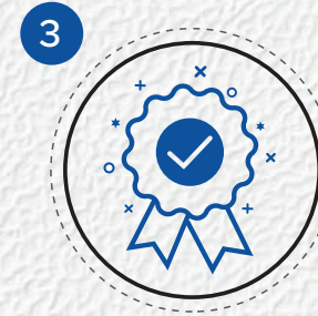
3 merit list