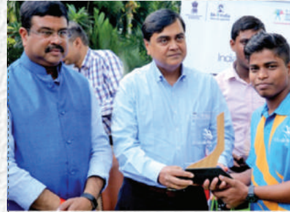
SDI presence in WorldSkills India 2018