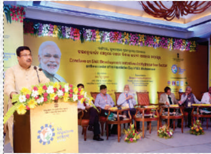
9th May 2017 National Conclave on Skill Development Initiatives