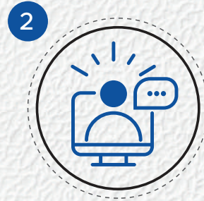
2 entrance test