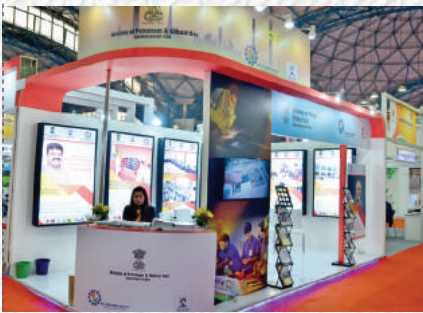
Presence in Petrotech, 2016