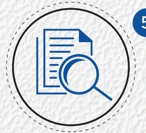
5 document verification